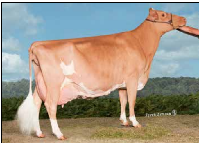
Spring River Royal Happy EX-95

Appraisal: 88 @ 6-01 Nominated All-American & Res. Junior All-American Fall Calf 1995 Nominated Junior All-American Fall Yearling 1996 Dtr: MARLEE VALIANT HAILEY 94 @ 6-06 (94/92) 4-00 365D 2X 27890M 4.2% 1180F 3.3% 907P DHIA Reserve All-American 2001 & 2003