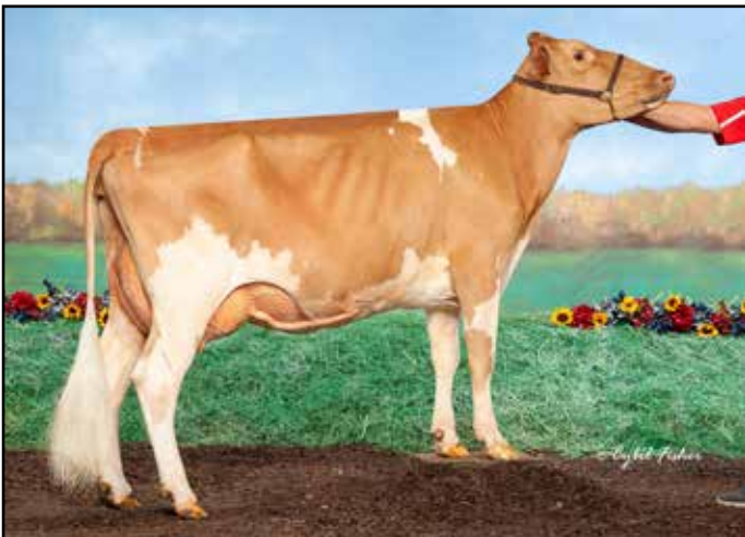
Coulee Crest Daniel Lily EX-90 3-06 360D 2X 32,180M 5.9% 1,889F 3.5% 1,120P Maternal Sister to 3rd Dam of Lot 7

Appraisal: 80 @ 9-04 Gold Star Dam - 1992 6-01 357D 2X 21602M 4.5% 974F 3.7% 792P DHIA