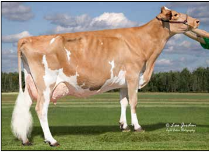
Chupps Spring Star JP Topanga EX-93 6-10 318D 26,530M 5.1% 1,359F 3.7% 974P Dam of Lot 3