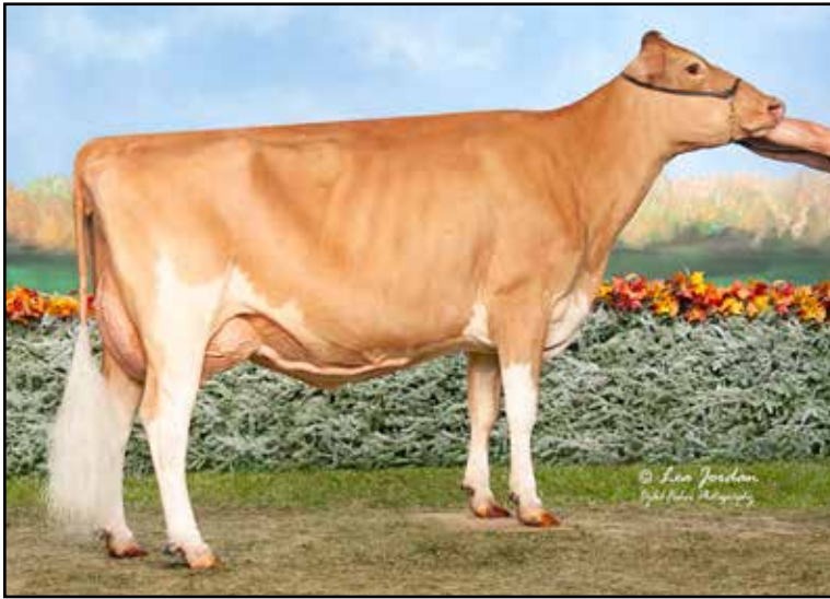
Myshan Viper Linden Honey EX-92 Nominated All-American Five-Year-Old 2025 Dam of Lot 7