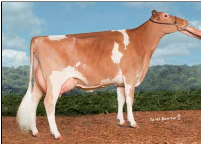
Hartdale Alstar Cutie EX-93 158,720M 4.2% 6,735F 3.1% 4,984P Lifetime Reserve Jr. All-American Jr. Three-Year-Old 2014 Maternal Sister to Dam of Lot 8

12/25 USDA GPTA -559M -0.03% -31F +0.03% -14P +1.1DPR +0.9PL -222NM$ 3NM%ile -218CM$ 59% Rel 2.97SCS -1.90HCR 33% Rel -0.60CCR 40% Rel 2.00LIV 35% Rel 0.10GL 42% Rel -0.10EFC 36% Rel 2 App 12/25 PTAT +0.3 +0.6UDR +0.7FLC 68%Rel CPI -25 Appraisal: EX 90 @ 5-10 (EVVVE) Senior Champion Ohio State Fair 2024