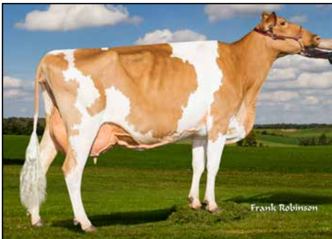
Rozelyn Jackpot Velmay EX-94 Granddam of Lot 2

5-04 365D 2X 20960M 4.8% 1004F 3.6% 763P DHIA