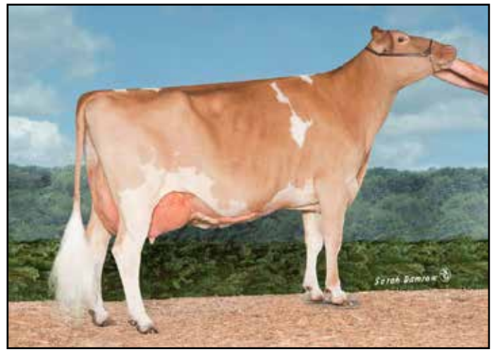
Hartdale Showtime Confetti EX-91 115,530M 4.6% 5,342F 3.2% 3,711P Life Reserve All-American Winter Yearling 2010 Granddam of Lot 8