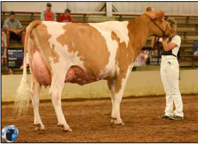
Hartdale Latimer Chloe-ETV EX-90 Senior Champion Ohio State Fair 2024 Dam of Lot 8