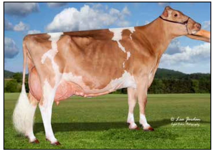
Pond N Pines Michelang Sunchip VG-87 2nd Summer Jr. 2-Year-Old GG Showcase 2025 Dam of Lot 9