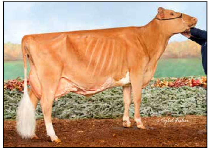
Knapps HP Fame Topeka-ET EX-94 121,240M 3.9% 4,688F 3.4% 4,138P Life All-American Sr. Two-Year-Old 2014 Granddam of Lot 3