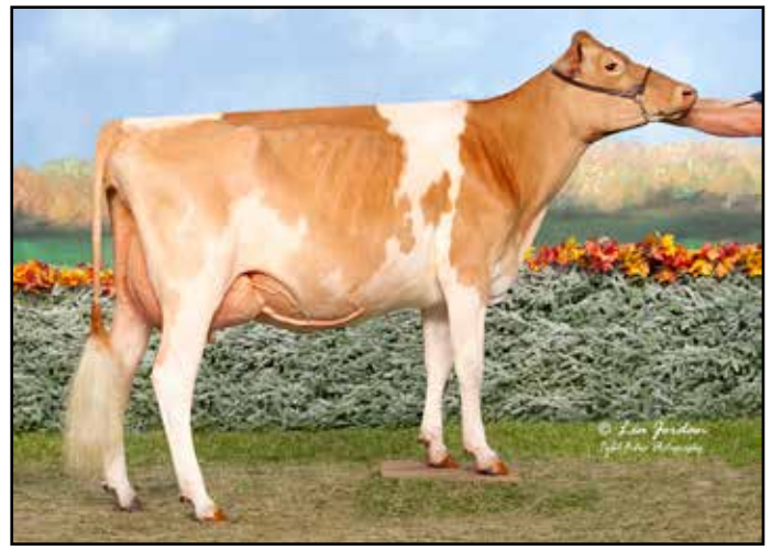
Up The Creek Jester Kazaam EX-91-2E 6-02 305D 2X 24,660M 4.5% 1,103F 3.1% 766P Unanimous All-American Jr. Two-Year-Old 2016 Dam of Lot 6