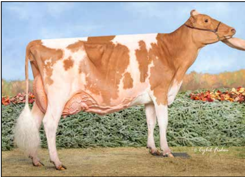
Cape May Latimer Honey EX-92

3-10 305D 2X 22,380M 4.9% 1,094F 3.3% 733P Dam of Lot 1